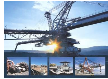
Conveyors for bulk handling