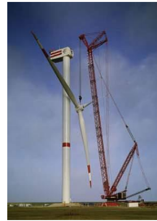
Cranes & lifting equipment