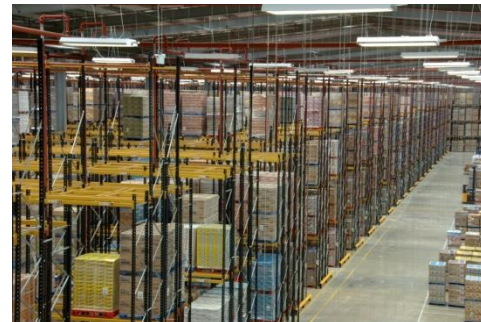
Racking & shelving