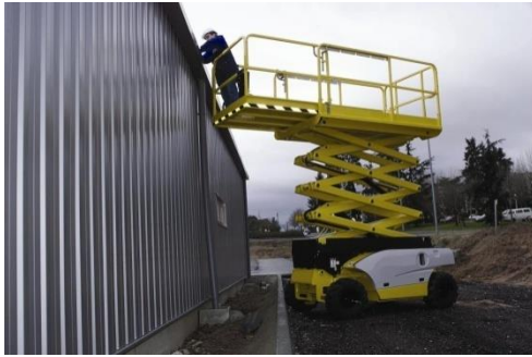
Mobile elevating work platforms