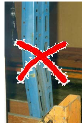
Lift truck collisions Not-Allowed