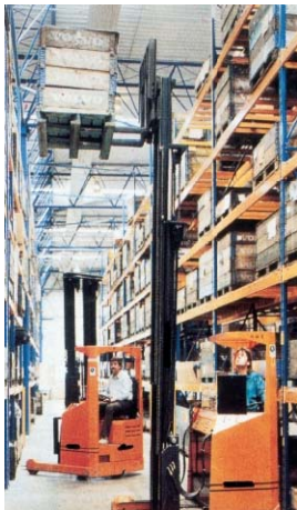
Reach truck (up to approx. 12 m)